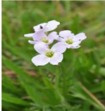
Lady's-smock/ Cuckooflower Four rose-pink to white (notched) petals. Leaves are divided. Can grow to 60cm. Cabbage family. Verges and meadows.

As I write this guide, very many lovely blooms are already appearing in April and some may still be flowering by the time you read this. Those precious strolls along Slanes for those of us lucky to be living in the country in these strange times, offer wonderful opportunities for learning and for remembering those flowers we may have forgotten.