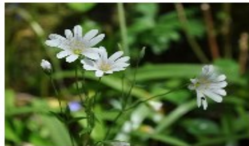
Greater Stitchwort Flowers are forked and on slender stems. Five, white, divided petals (2-3cm diam.). Leaves dark green and pointed. Campion family. Hedgebanks