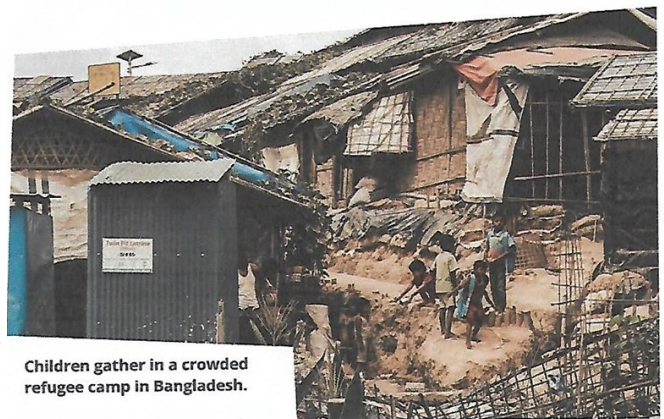
Children gather in a crowded refugee camp in Bangladesh.

This year our Christian Aid Week will begin with a special service – this year through Zoom rather than us meeting in the 'flesh'. It will enable us to pray with all our neighbours who live in the most difficult of circumstances. We will not be able to send out collectors to raise funds from the houses of the district. But we will be able to donate on line by contacting caweek.org/payin . We encourage as many of you as possible to give as generously as possible to support this essential work. It really is as simple as going to caweek.org/payin .