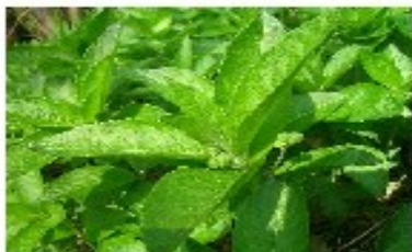
Dog's Mercury 'Dog' refers to a plant which is common, poisonous or of little use. This one, although a lovely sign of spring's arrival is poisonous. Male (above left) and female flowers (below) with hairy spheres) on separate plants. Leaves 3-8 cm long and toothed. Spurge family. Hedgerows, woods and verges.