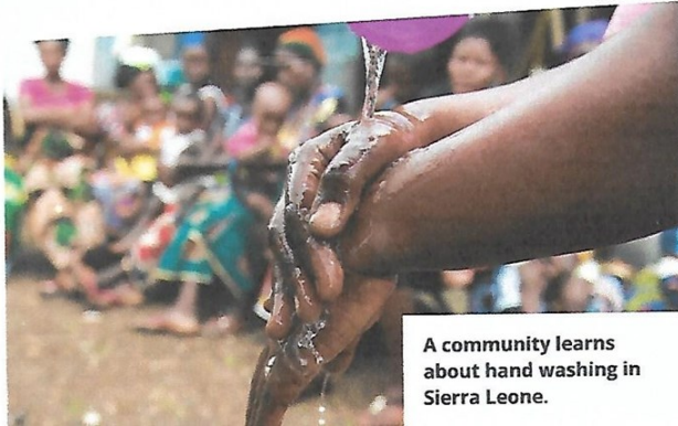
A community learns about hand washing in Sierra Leone.

Christian Aid too has changed its practice. Originally this year's campaign was to be centred on climate change. It would have informed us about Christian Aid projects working with partners in Kenya and the Philippines.