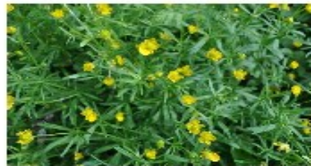
Goldilocks A member of the buttercup family with small, golden-yellow flowers often with 'missing' petals. The leaves are divided, like fingers. Found in woodlands and on shady verges.