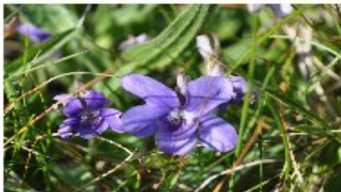
Common Dog-violet Petals with 'Bugs Bunny ears' are blue-violet (Sweet Violets are often white). The 'spur' at the back is curved, creamy and notched. Violet family. Hedgebanks, dry grassland and verges.